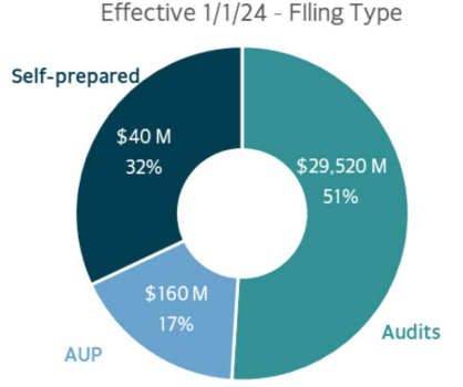
Current - Filing Type